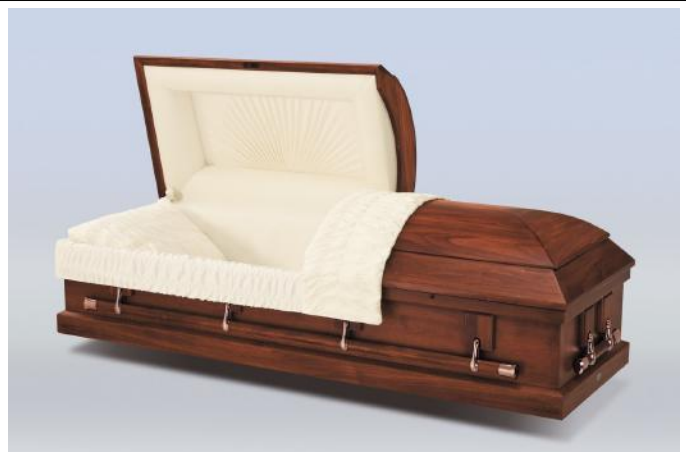
Libra – Harvest Red (Hardwood)