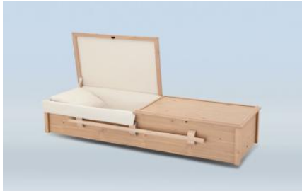
Shaker Pine (Hardboard)

Itemized = $4,400 to $4,900 ($1,105 to $1,605 Savings)