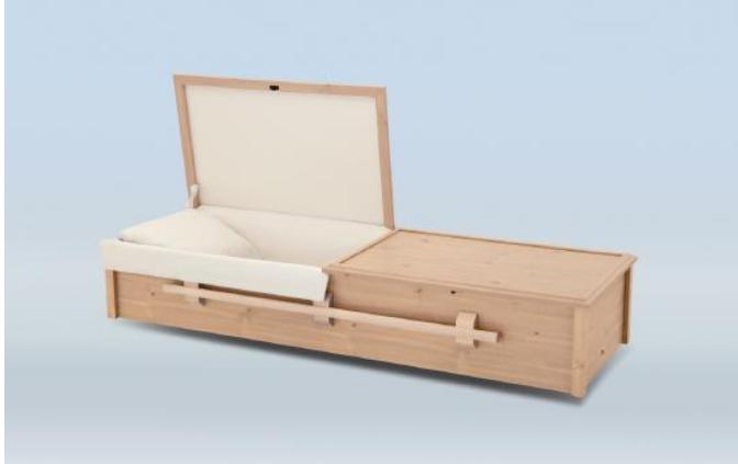
Shaker Pine (Hardboard)

With Shaker Pine Casket = $3,995 Itemized = $4,845 to $5,345 ($850 to $1,350 Savings)