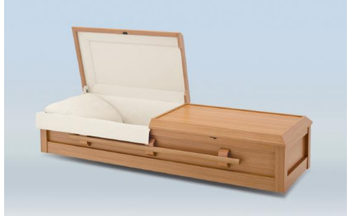
Bayview Beech (Hardboard)

With Bayview Beech Casket = $4,295 Itemized = $5,145 to $5,645 ($850 to $1,350 Savings)