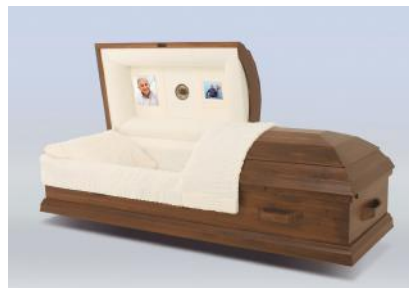
Parkside (Select Hardwood)

With Parkside Casket = $7,175 Itemized = $7,692 to $8,192 ($517 to $1,017 Savings)