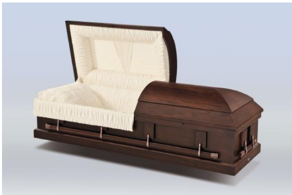
Libra – Harvest Brown (Hardwood)

With Libra Casket = $6,795 Itemized = $7,312 to $7,812 ($517 to $1,017 Savings)