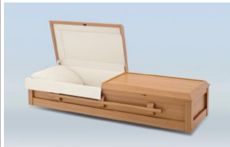
Bayview Beech (Hardboard)