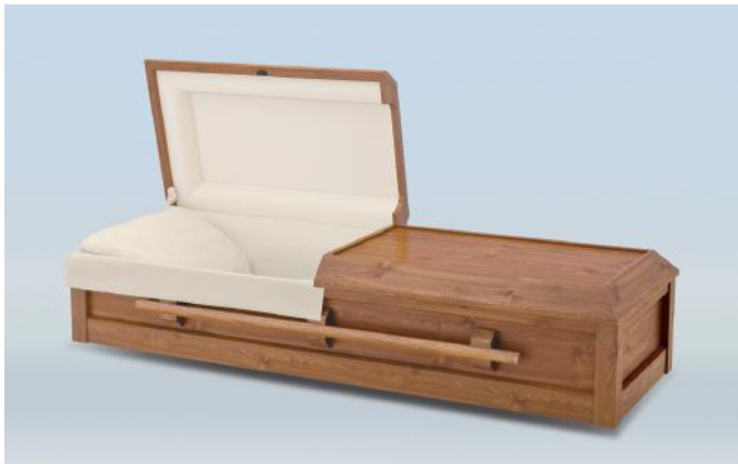
Pacific Pine (Hardboard)

With Pacific Pine Casket = $4,395 Itemized = $5,245 to $5,745 ($850 to $1,350 Savings)