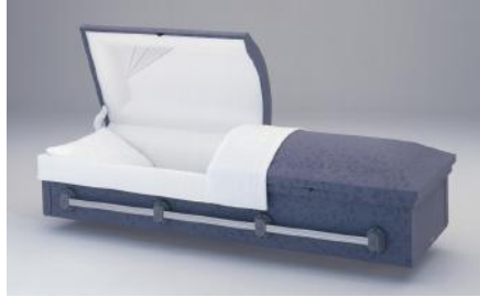
Cloth Covered (Fiberboard)

With Cloth Covered Casket $2,995 Itemized = $4,200 to $4,700 ($1,205 to $1,705 Savings)