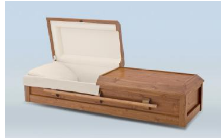
Bayview Beech (Hardboard)

Itemized = $4,700 to $5,200 ($1,205 to $1,705 Savings)